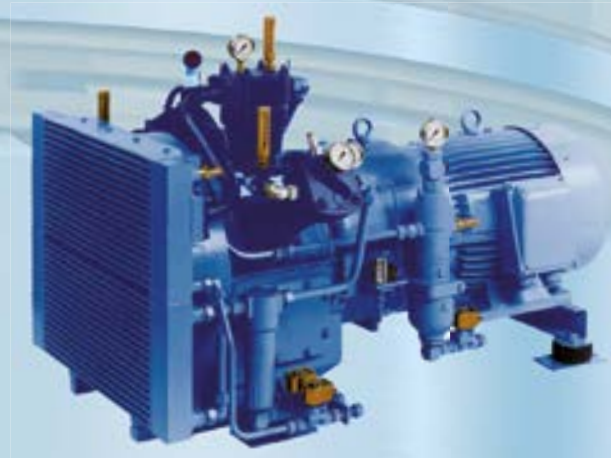
HLD on rubber-bonded metal bearing

Thanks to their well-conceived modular principle the series provide all options for use, even under the toughest industrial conditions up to 40 bars.