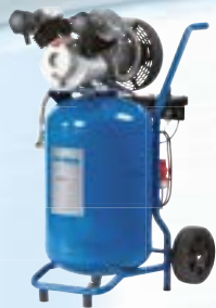
AT 6002 AT 7002