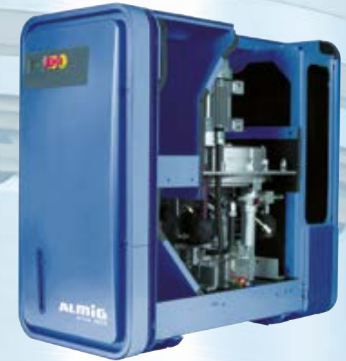
HP, in standard soundproof housing