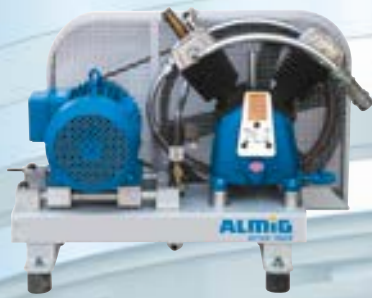
Booster on base plate