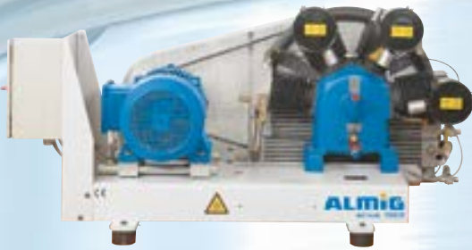
HL on base plate