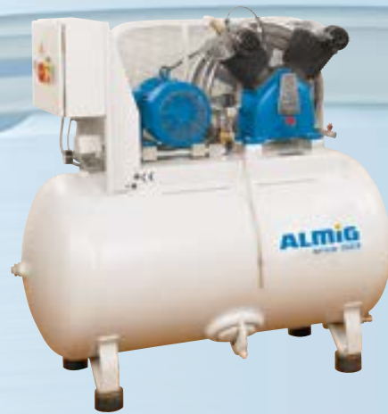
HL on receiver