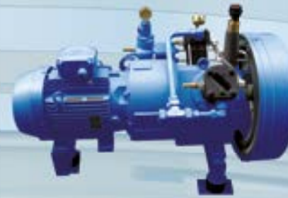
Booster on anti-vibration mounts